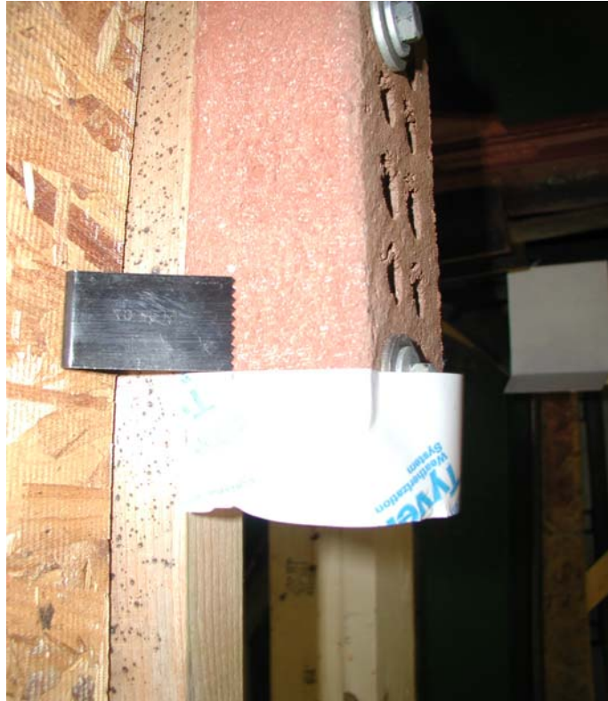
Figure 4. Clip attachment detail (Mark (not visible in the photo) on the Tyvek tape was used to monitor location of the clip).