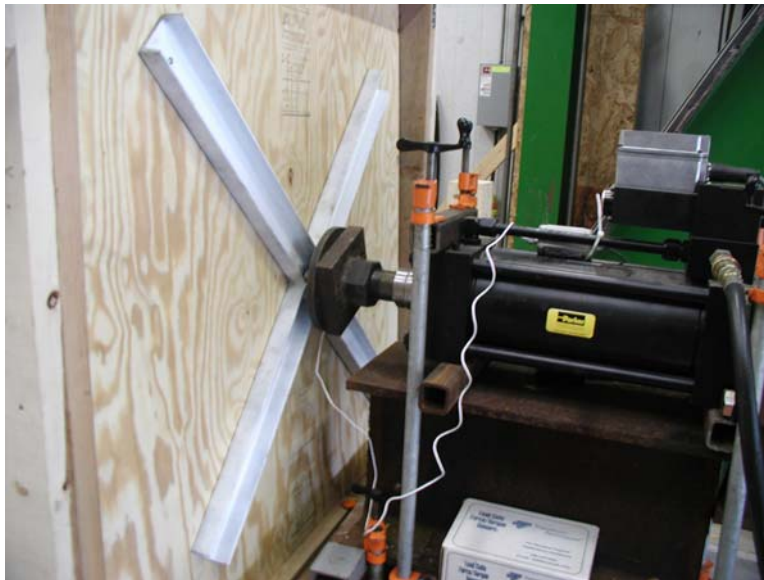
Figure 3. Hydraulic cylinder & load panel used to apply cyclic load to an air bag placed between the loading apparatus and the test specimen.