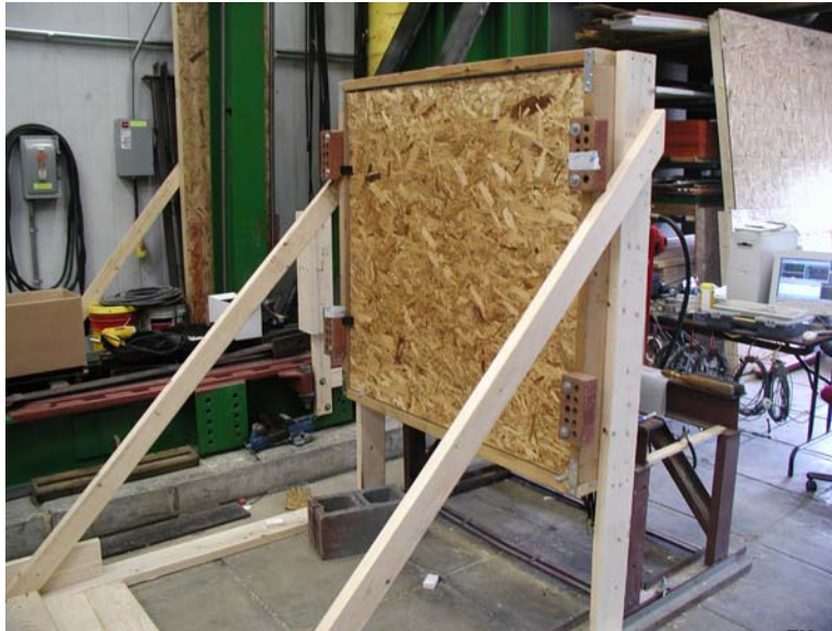
Figure 2. Test Frame with panel mounted to brick with Plylox™ clips.

bag (4' x 4' x approximately 6") was installed behind (on the interior side) of the debris panel. A second stiffened panel (load panel) was installed behind the air bag sandwiching the bag between the panels. The load panel was connected to a hydraulic cylinder. A load cell was installed on the cylinder to measure the force exerted on the air bag by the load panel. The hydraulic cylinder was operated by a servo controlled valve and computer controller programmed to use the load cell output to generate the cycles and pressure swings noted above. The average cycle time was approximately two seconds.